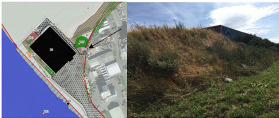
Figure I1: Location and photograph of Himalayan balsam within Order Limits