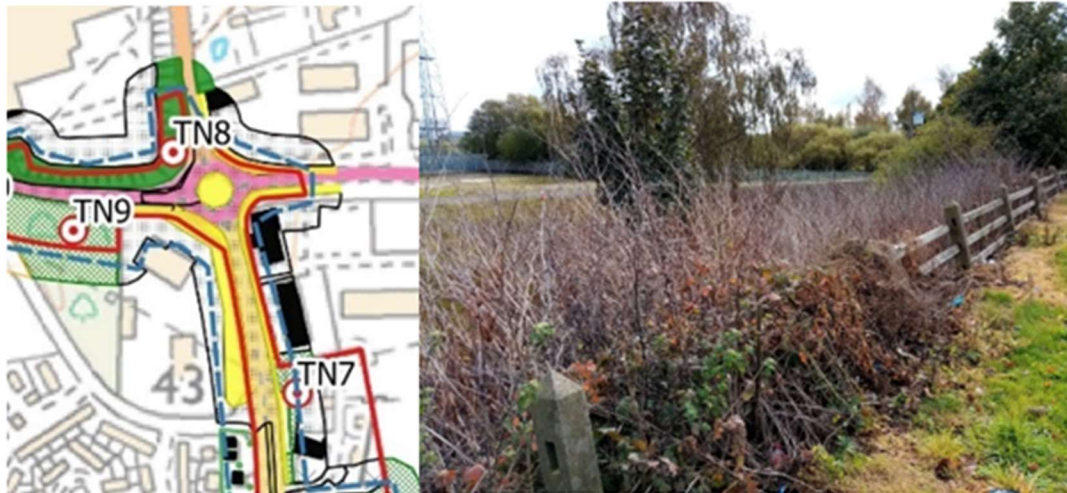
Figure I2: Location (TN7) and photograph of Japanese knotweed within Order Limits